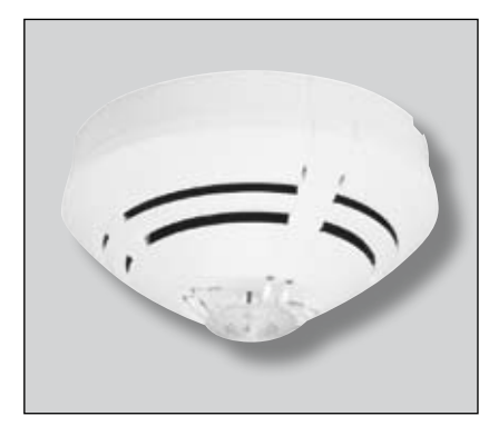
IQ8Quad O2T detector